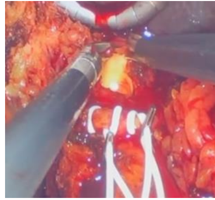
Figure 2: The left hepatic duct and is removed a 1.5 cm stone.

A laparoscopic cholecystectomy was initiated, revealing a Parkland V type gallbladder, a catheter was introduced into the cystic duct and an intraoperative cholangiography was performed, showing a filling defect at the level of the left hepatic duct, as well as multiple distal stones and a variable of double right hepatic duct (Figure 1). It is irrigated with saline solution, seeing spontaneous discharge of two stones < 5 mm, a flexible ureteroscope is introduced. At the approach site of the left hepatic duct with passage through the common bile duct to the duodenum without the presence of stones, a 12 Fr T-tube is placed, placing three stitches with 4-0 Vicryl. Saline solutions are instilled and hermeticity is checked, a new cholangiography is taken with a normal appearance (Figure 2-5).