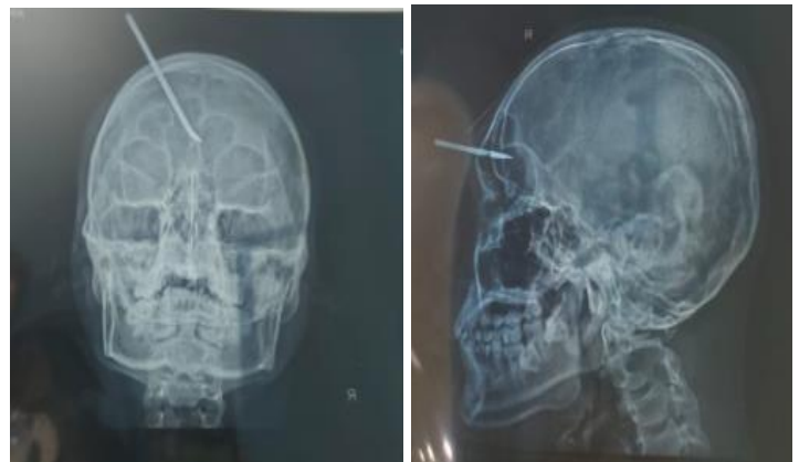
Figure 5: Head X-Ray.

In head injury patient management, physician needs to prevent or reduce conditions that can worsen outcomes of the patient. Initial examination should include a proper history of the injury (date, time, duration of loss of consciousness if present, seizure, any comorbid if exist, and also the usage of anticoagulants and antiplatelet agents). A complete physical examination should be performed including neurological examination [10]. In the pre-hospital setting, or in non-trauma facilities, stabilize, but, do not remove penetrating objects such as knives. Patients should be transported quickly to a location capable of providing definitive care. Early recognition of high-risk mechanisms, early imaging, and early evaluation at trauma center may improve outcomes [11,12]. A Computed Tomography (CT) scan of the head obtained if the patient is hemodynamically stable (Figures 4 and 5). A CT scan can adequately identify the extent of the intracranial injury and can also determine the relationship between the penetrating object and the intracranial structures. In the result section, we include an illustration of weapon's (arrow) length and the impact for the victim's; the measurement based on research of average adult male frontal sinuses measurement with